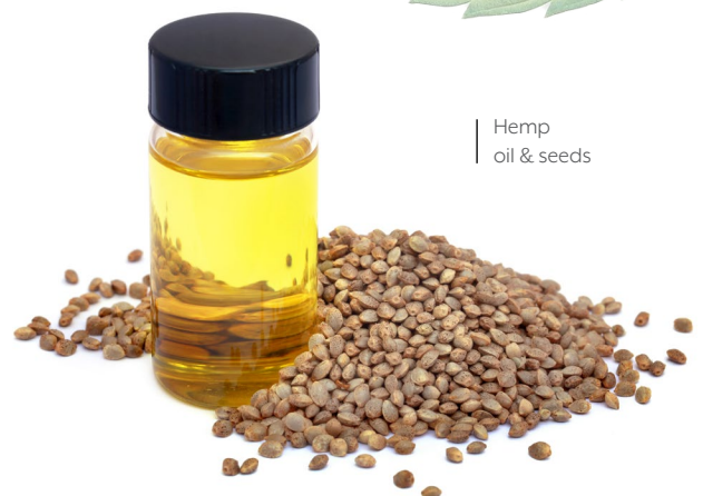
Hemp oil & seeds

To identify and adopt optimized hemp production practices, the public and private sectors must recognize what producers need. The public sector should coordinate large-scale and regionalized performance trials for foundational management knowledge including planting and harvest schedules, input usage, and variety recommendations. Furthermore, the public sector should facilitate the sharing of knowledge through variety choice guides, production guides, and enterprise budgets to show potential costs and returns. The public sector also has a key role in identifying sustainable practices for hemp production and how best to encourage those practices. The private sector must forge partnerships across companies to facilitate the concurrent development of innovative products to serve the needs of producers and the large production landscape. Additionally, the private sector must develop products with a common goal of generating returns on investment for both companies and the producer.