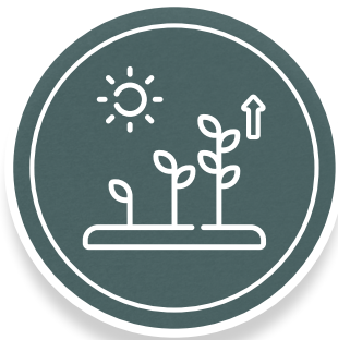
Best Practices for Production