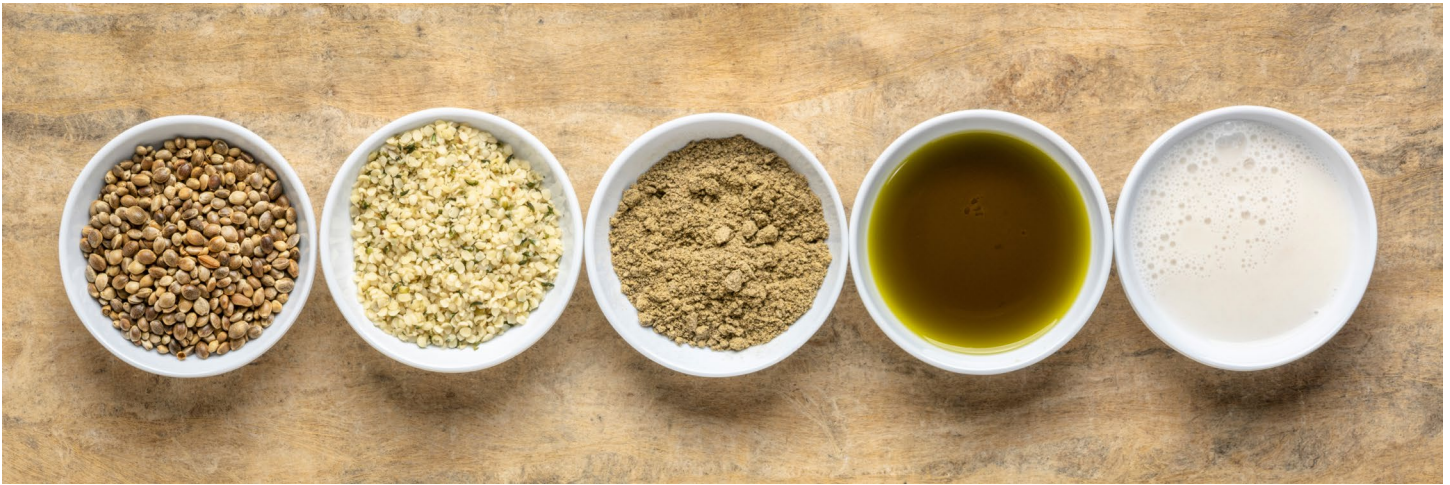
Hemp seed products: hearts, protein powder, oil & milk

To build upon ongoing collaborations and coordination across the hemp industry, Oregon State University's Global Hemp Innovation Center and the USDA co-organized the National Hemp Industry Research Needs Workshop in November 2022. The workshop brought together leaders from academia, industry, and government to identify the significant gaps, challenges, and opportunities for research to support development of a globally competitive U.S. hemp industry. The Workshop focused on six topics spanning all aspects of hemp value chains: plant breeding and genetics, sustainable agricultural production, harvest and materials processing, product manufacturing and supply chains, economics and markets, and testing and compliance.