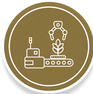
Biobased Products Manufacturing for End-Uses