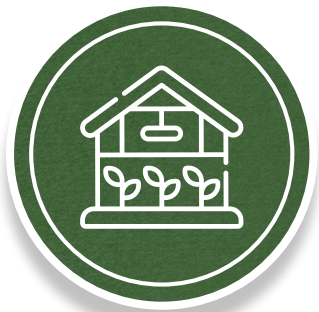
Breeding and Genetics

This roadmap categorized four hemp research needs areas with overarching goals: