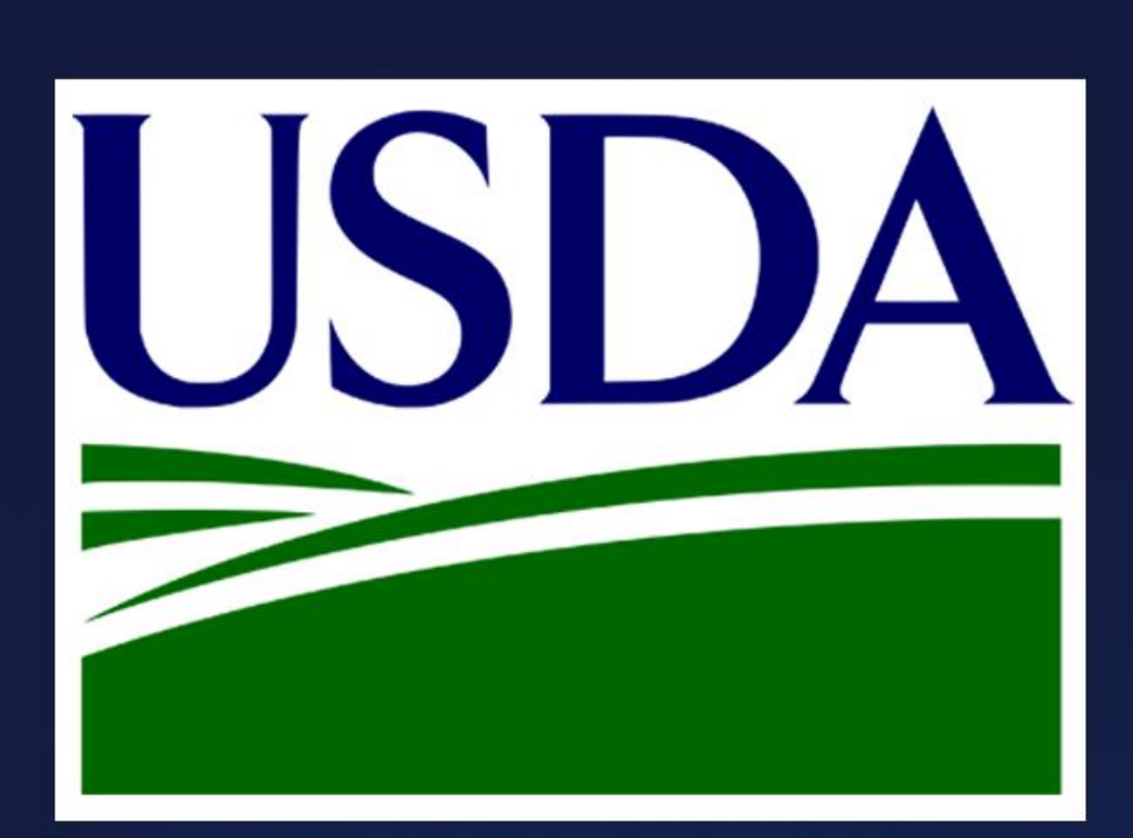
U.S. DEPARTMENT OF AGRICULTURE "The People's Department – Every Day, Every Way"