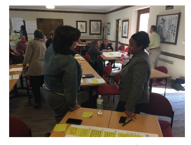
Figure 3: Workshop attendees putting the finishing touches on this action plan.

Among the attendees were local and regional representatives of the city, Youngstown State University, the Eastgate Regional Council of Governments, elected officials, and residents involved in gardening, urban farming, development, and businesses. Local representatives of the Common Wealth Kitchen Incubator, Lake-to-River Food Cooperative, the 30-Mile Meal Project, and Grow Youngstown were also heavily involved in