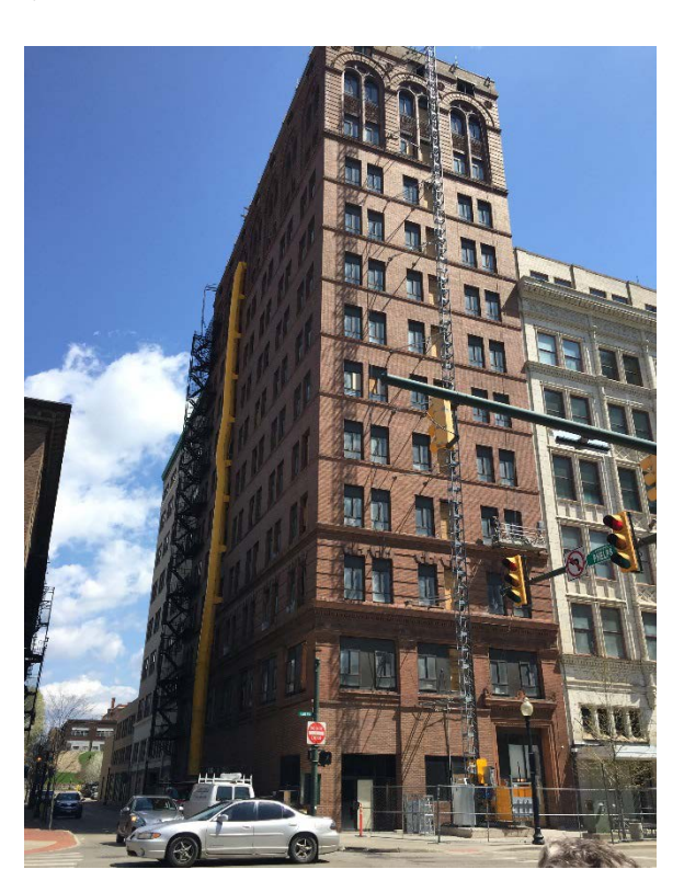
Figure 1: Downtown Youngstown is attracting new investment, raising hopes for the city's future.

While the city still faces many economic challenges, there are many signs of change in 2015. Downtown Youngstown is awakening with new restaurants, apartments, and planned hotel rooms. Downtown benefits from its proximity to Youngstown State University (YSU), which is located just north of the central business district. The city has also seen a return of a small number of steel jobs with the opening of the Vallourec Steel Mill. The city's vacant properties have also become a source of renewal and revitalization, with people across the city producing food in about 25 community gardens and seven urban farms.