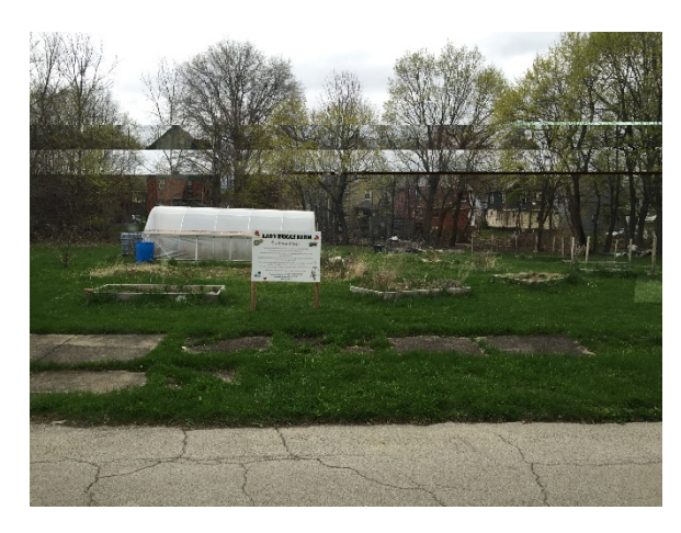
Figure 2: Lady Buggs Farm is an example of how Youngstown is putting vacant lots in the city's neighborhoods back to productive use.

Recognizing this obstacle, the Youngstown Neighborhood Development Corporation (YNDC) in