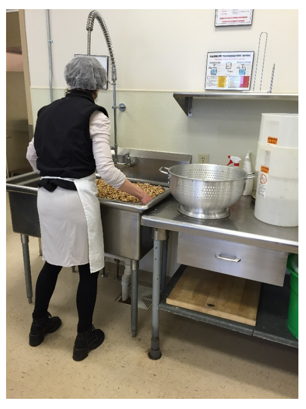
Figure 7: A local entrepreneur working on her trail mix recipe at the incubator kitchen.