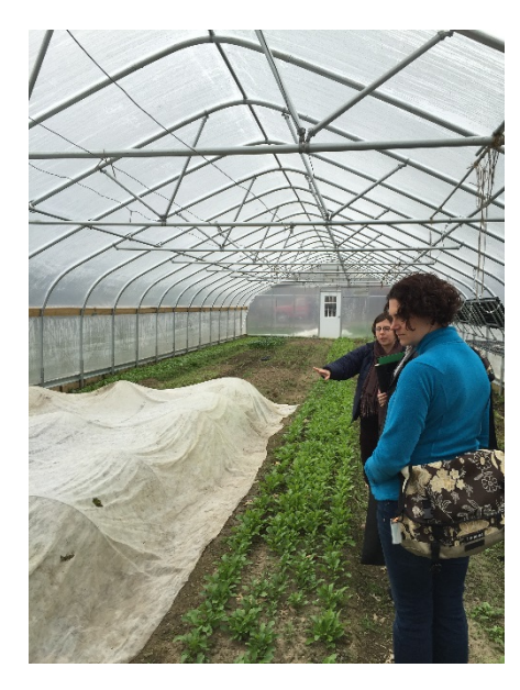
Figure 6: The Iron Roots Urban Farm has a pair of large greenhouses.