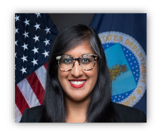
Deputy Under Secretary Farah Ahmad

Because we understand a strong community is rooted in its people, USDA Rural Development's Equity Action Plan embodies comprehensive measures meant to promote significant, long-term, systemic change. Working in partnership with rural communities across the country, our equity strategies benefit not only rural and Indigenous people, but also the broader American public. After all – whether through farming and ranching, business, or manufacturing – rural people deliver many of the everyday essentials upon which our country