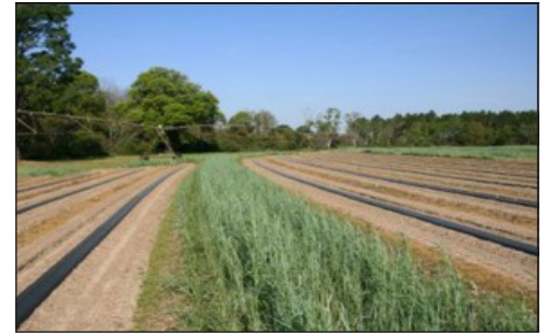
Farm ponds can be reliable sources of water for irrigation.

A well consists of a hole, with or without a supporting casing extending down into a water-bearing formation. Wells are dug, driven or drilled depending on the soils, rock and the depth to the water table. Wells usually require a permit.