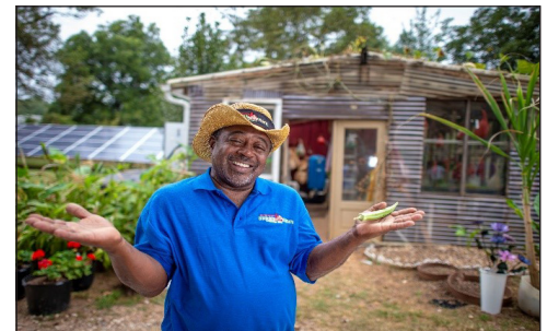
Contact a specialist from NRCS for more assistance

Guidance documents lack the force and effect of law, unless expressly authorized by statute or incorporated into a contract. USDA may not cite, use, or rely on any guidance that is not available through their guidance portal, except to establish historical facts.