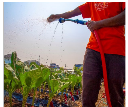
A clean reliable water source is important for your irrigation system

Guidance documents lack the force and effect of law, unless expressly authorized by statute or incorporated into a contract. USDA may not cite, use, or rely on any guidance that is not available through their guidance portal, except to establish historical facts.