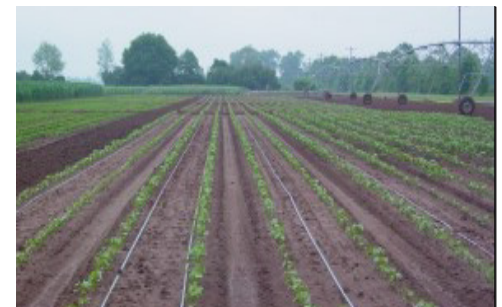
Typical drip irrigation system

Guidance documents lack the force and effect of law, unless expressly authorized by statute or incorporated into a contract. USDA may not cite, use, or rely on any guidance that is not available through their guidance portal, except to establish historical facts.