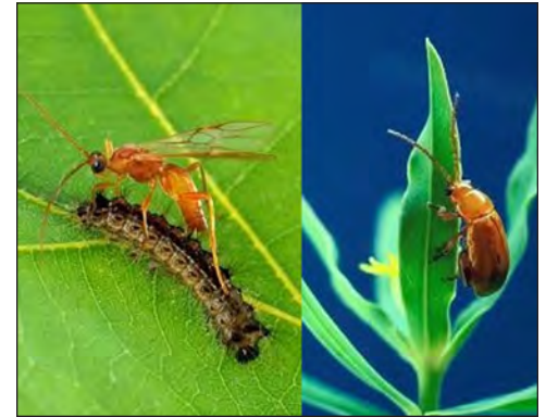
Wasp and fleas feeding are a method of bio-control.

The goal is to attract natural predators to your farm, keep them in your fields, and avoid killing them when applying pesticides.