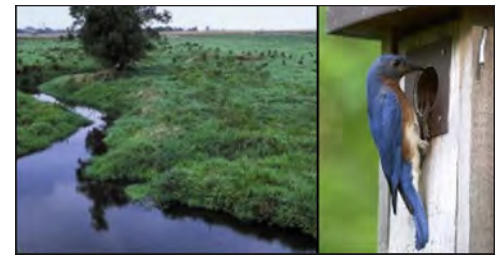
Appropriate wildlife habitat is critical.

Unfortunately, beneficial insects are susceptible to many pesticides. Use of insecticides can reduce beneficial insect populations, so choose and use these with care and only as needed to control pest populations.