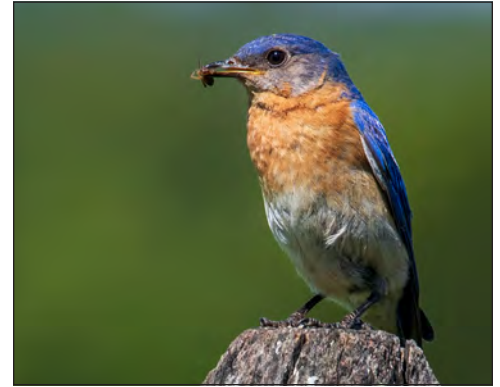
Eastern Bluebird ( Sialia sialis ) with insect.