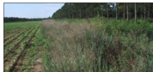
Borders of natural vegetation on field edges provide habitat for beneficial insects.