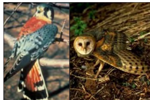
American Kestrel ( Falco sparverius ) and Barn Owl ( Tyto alba ).