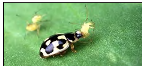
A ladybug eating an aphid.

It is relatively easy to find bat houses to purchase or you can obtain plans, available from many sources to build your own. Houses can be placed on poles, the sides of buildings, dead trees, or other structures. The bottom of the bat house should be 12 to 15 feet off the ground. Place the house in an area where it will receive plenty of sun. Bat houses within a quarter mile of a lake, pond, river, stream, or open marsh have a greater chance for success.