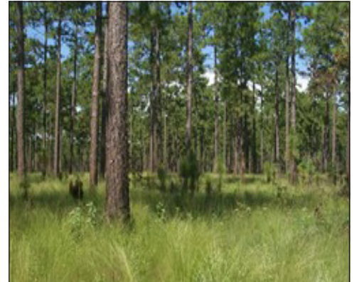
Managing your woodlands is important.