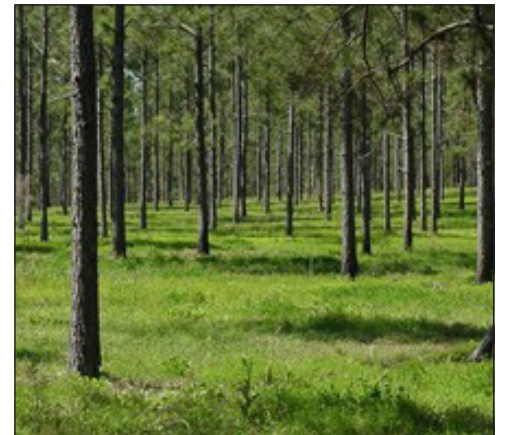
Pruning your woods can assist you diversify your operation.

Guidance documents lack the force and effect of law, unless expressly authorized by statute or incorporated into a contract. USDA may not cite, use, or rely on any guidance that is not available through their guidance portal, except to establish historical facts.