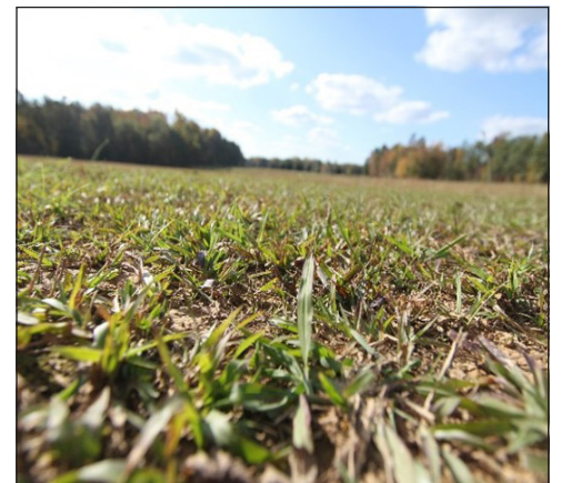
Managing your grass resources will give the best return.

Guidance documents lack the force and effect of law, unless expressly authorized by statute or incorporated into a contract. USDA may not cite, use, or rely on any guidance that is not available through their guidance portal, except to establish historical facts.