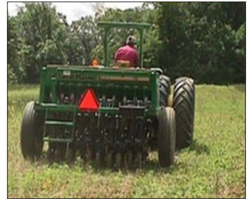
Adding desirable and compatible forages with a no-till drill to failing stands with no competition.

The cost to plant forages depends on if the stand is perennial or annual and if you are starting with pasture that needs to be renovated, cropland converted and enhanced by adding forage to the base, or quick supplemental feed. Main costs associated include site preparation, fertilizer, seed/sprigs, and pesticides if needed.