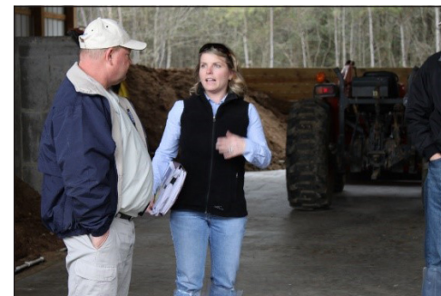
Working with your local specialist will be critical to manage odor issues on your farm.

Guidance documents lack the force and effect of law, unless expressly authorized by statute or incorporated into a contract. USDA may not cite, use, or rely on any guidance that is not available through their guidance portal, except to establish historical facts.