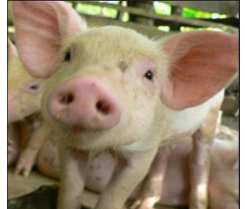
Dirty, manure-covered animals can help accelerate bacterial growth.

Dead animals stink. Normal mortality from livestock operations must be properly handled for both odor control and to prevent the spread of diseases.