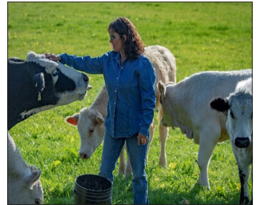
Clean dry animals do not smell as bad.

You can manage odor by reducing the original source of the smells or by limiting the amount of odor that is released into the air and carried away from your operation.