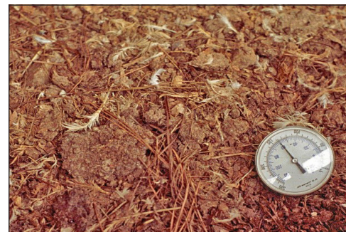
Properly composted material is not a source of odor.

Manure storage ponds and tanks can be a source of strong odors. Covers over a manure storage can reduce odors. Various types of covers are available.