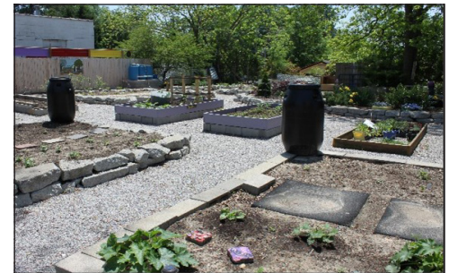
With proper management, rainwater can become an alternative source of irrigation.