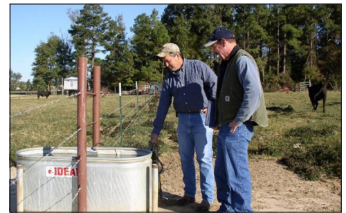
A well protected heavy use area will assist you managing your runoff.

Guidance documents lack the force and effect of law, unless expressly authorized by statute or incorporated into a contract. USDA may not cite, use, or rely on any guidance that is not available through their guidance portal, except to establish historical facts.