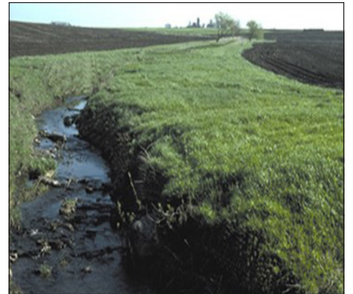
Ensuring that runoff is filtered before getting into streams is the focus of runoff management.

Correcting water problems around your livestock buildings will benefit both you and your animals. You may find that after these problems are fixed, you spend less on building and equipment maintenance. Keeping livestock dry and healthy may also increase your profits.