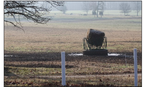
Cattle feeding on a hay ring in a muddy unprotected lot.