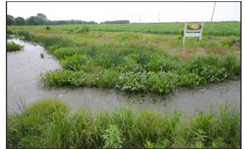
Runoff Management incorporate agronomical and engineering measures that function as a system.

When possible, the best place for water to run is into grass. Water and pollutants can soak into the ground, and the grass will trap mud from the water. Grass filter strips or buffers need to be designed at the right width and slope so an erosion problem doesn't start and cause gullies.