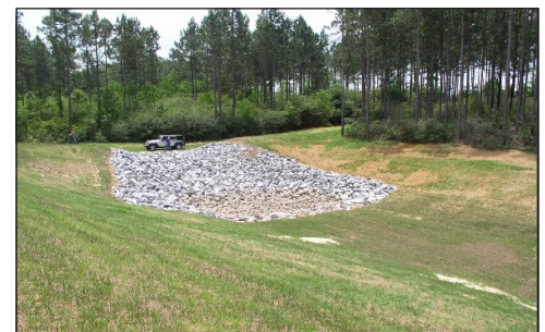
A combination of practices like grasses waterway and grade stabilization is a tool that can be incorporated into your conservation plan.

Guidance documents lack the force and effect of law, unless expressly authorized by statute or incorporated into a contract. USDA may not cite, use, or rely on any guidance that is not available through their guidance portal, except to establish historical facts.