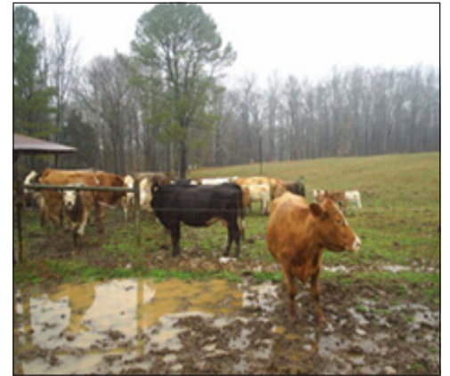
Poor runoff control can be detrimental to livestock health.

Runoff management refers to controlling water running off roofs, driveways, feedlots, and other places around the buildings on a livestock farm.