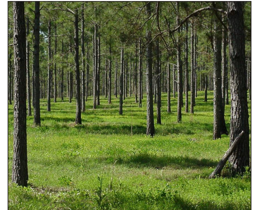
Silvopasture combines livestock, forage and tree production on the same acreage.