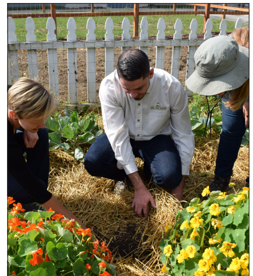
NRCS partner assisting small scale farmer with developing a customized conservation plan.

Visit the Natural Resources Conservation Service or visit farmers.gov/service-locator to find your local NRCS office. You can also check with your local USDA Service Center, then make an appointment to determine next steps for your conservation goals.