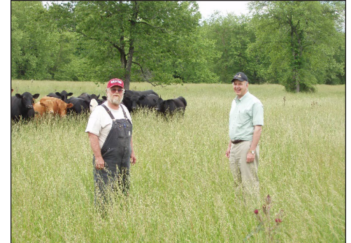
An example of Pine Silvopasture system.

Guidance documents lack the force and effect of law, unless expressly authorized by statute or incorporated into a contract. USDA may not cite, use, or rely on any guidance that is not available through their guidance portal, except to establish historical facts.