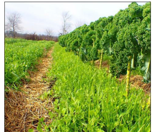
Maximize soil cover with mulch and cover crops.

Maximize continuous living roots to help maintain or increase soil organic matter and enhance nutrient cycling. The more above ground living plant material present, the more living roots below ground. Continuous living roots support biological activity, nutrient cycling, and soil water regulation. Use of cover crops can help feed the system between crops.