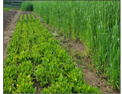
Crop rotations that include cover cropping.

Only “living” things can have health, so viewing soil as a living ecosystem reflects a fundamental shift in the way we care for our soils. Soil isn’t an inert growing medium, but rather is teeming with billions of bacteria, fungi, and other microbes that are the foundation of an elegant and complex ecosystem. Soil can be managed to provide nutrients for plant growth, absorb and hold rainwater, filter and buffer pollutants, provide habitat for soil organisms, and adapt to changing climate.