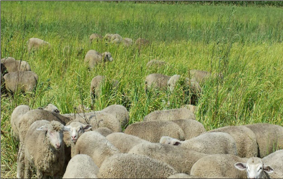
Sheep grazing to help recycle nutrients.