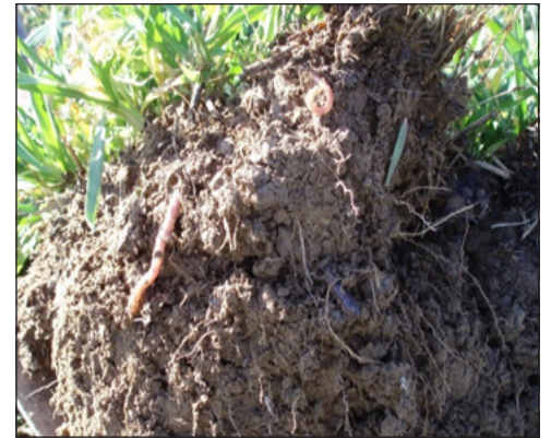
Healthy soil is alive!