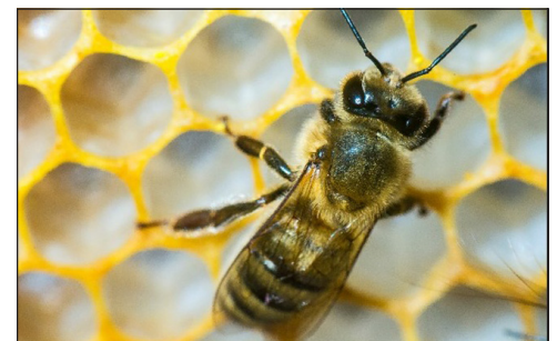
Vegetative barriers can provide food for pollinators.

Guidance documents lack the force and effect of law, unless expressly authorized by statute or incorporated into a contract. USDA may not cite, use, or rely on any guidance that is not available through their guidance portal, except to establish historical facts.