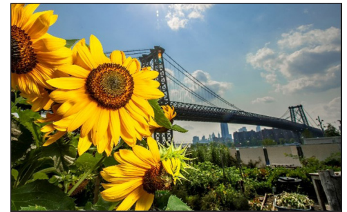
Pollinator species can be used for barriers.